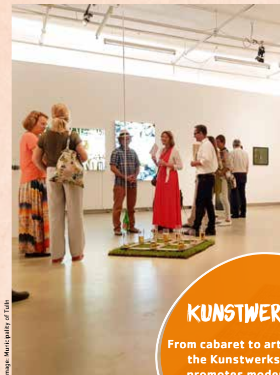
Thriving creative scene: Regional handicraft in the Kunstwerkstatt.

While Egon Schiele is without doubt one of the most illustrious characters in Tulln's artistic history, the present is also full of creative personalities making big contributions to its vibrant cultural scene. These include numerous choirs, singing and cultural associations as well as a multitude of artists and artisans who present their works on various platforms: in the Monastery of the Friars Minor, in the Kunstwerkstatt, on the art studios' annual Doors Open Day, at markets on the town square, as part of events and exhibitions at DIE GARTEN TULLN, in the surrounding garden centres and tree nurseries as well as online.