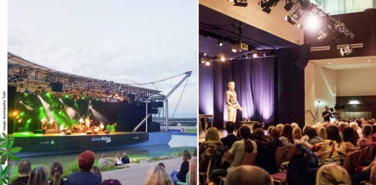
Donaubühne: Cultural events on the river Danube.