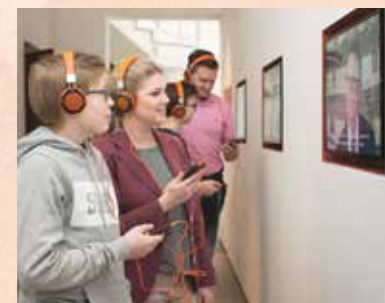
The Schiele Experience: A journey into the great artist's life.

Tulln offers a multitude of locations from the phenomenal artist's youth. The Egon Schiele Trail offers the opportunity to experience all the important locations in Tulln related to the world-renowned artist with historical photos and interactive elements.