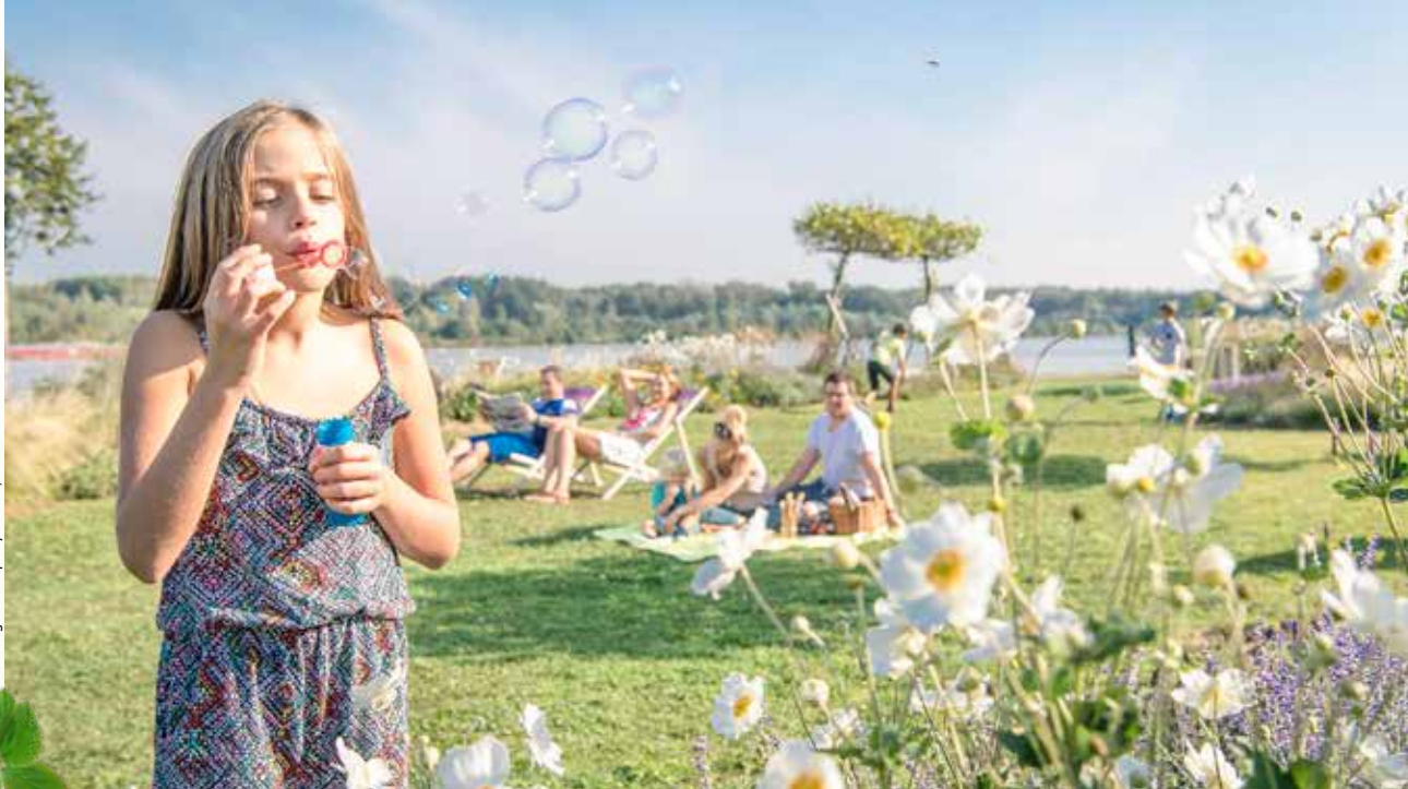
Quality time by the Danube: The picnic area at the Donaulände invites you to stay and relax.